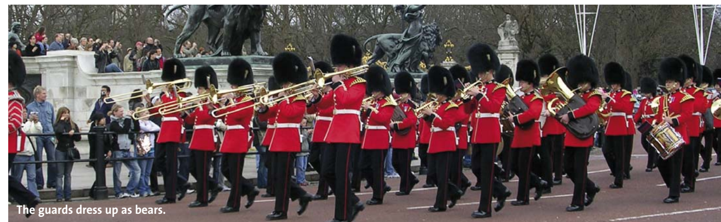
The guards dress up as bears.