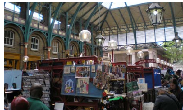
The stalls in the Covered Market

Covent Garden used to be a fruit and vegetable market situated in the district of Westminster in London. Why is it called Covent Garden? It was first a convent market. The monks from Westminster Abbey grew vegetables and sold some of them here, starting the first Covent Garden market. For hundreds of years, fruit, vegetables and flowers have been sold here. The Central Market was built in 1830. It housed the Covent Garden until it moved in the 1970's. But you can still shop in Covent Garden today! The old Central Market buildings were restored and today they are full of small shops and stalls selling crafts.