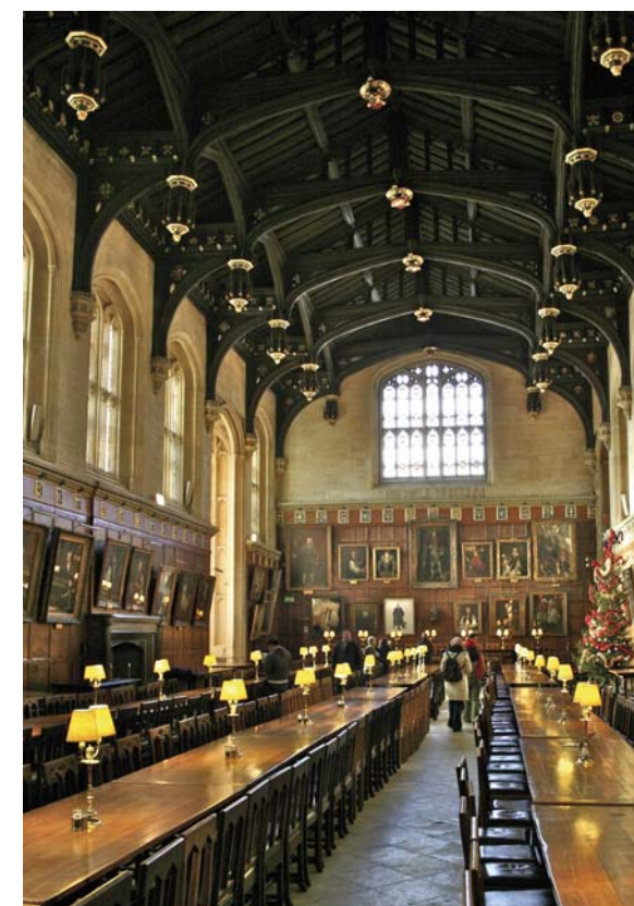
The famous dining hall in Christ Church College.

And then we came into the famous dining hall! At first, we were quite disappointed, because it looked quite small compared to the dining hall in the film. But we immediately had the feeling that we were being watched: were there ghosts in this dining hall too? Or were there cameras watching the visitors like everywhere in Oxford? We walked towards the end of the hall, as if Henry VII, the king of England who founded Christ Church college in 1529, was looking at us. But it seemed that all eyes were on us.