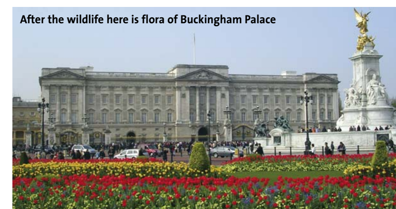
After the wildlife here is flora of Buckingham Palace