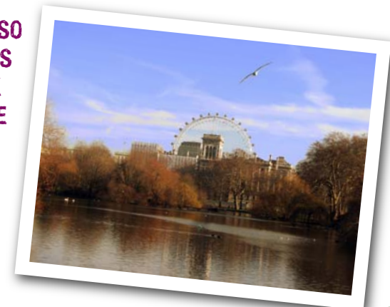
St James's Park as you usually see it...